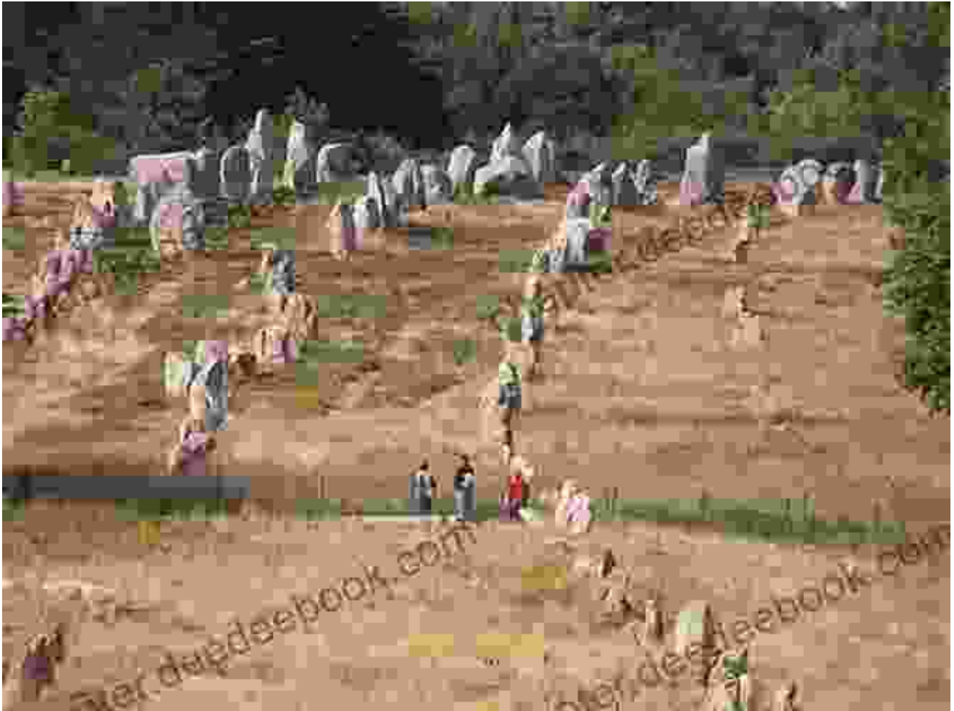
Panoramic view of the Carnac alignments