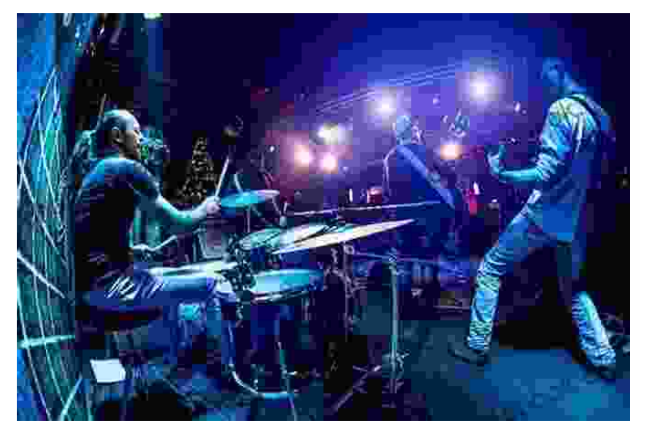
Songwriting: How to Write a Hit Song! by White Dove Books