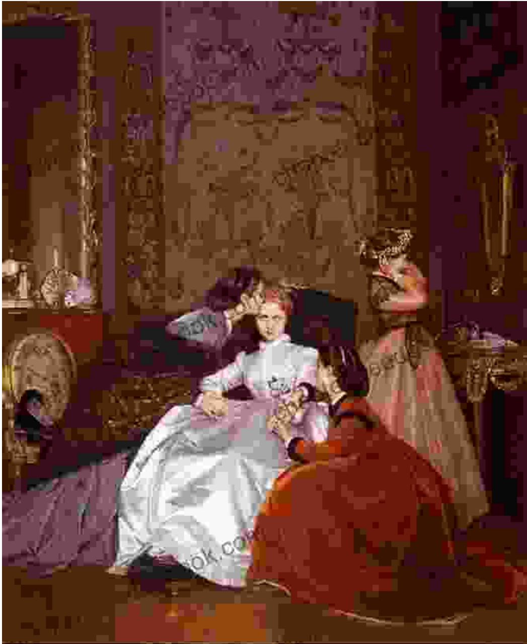
Auguste Toulmouche, The Temptation, 1864