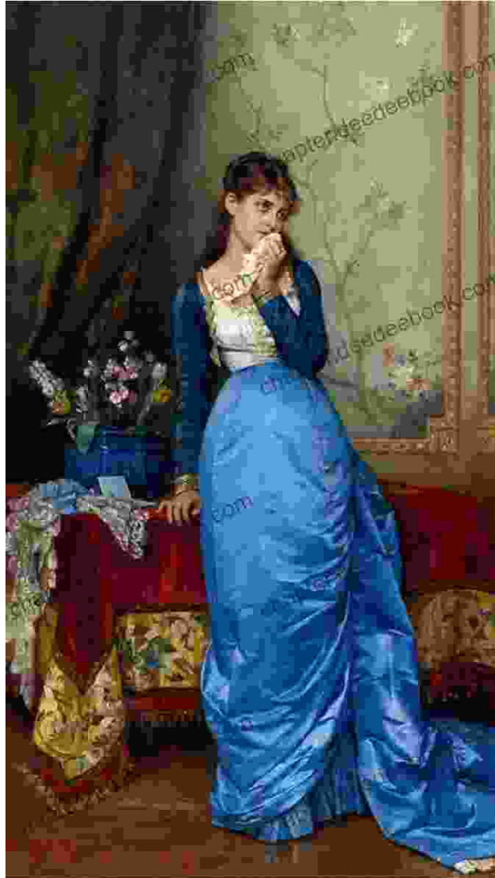
Auguste Toulmouche, The Young Reader, 1884

This charming painting depicts a young girl reading a book. Her face is a mixture of concentration and curiosity as she immerses herself in the story. The soft, pastel colors and delicate brushstrokes convey the innocence and wonder of childhood.