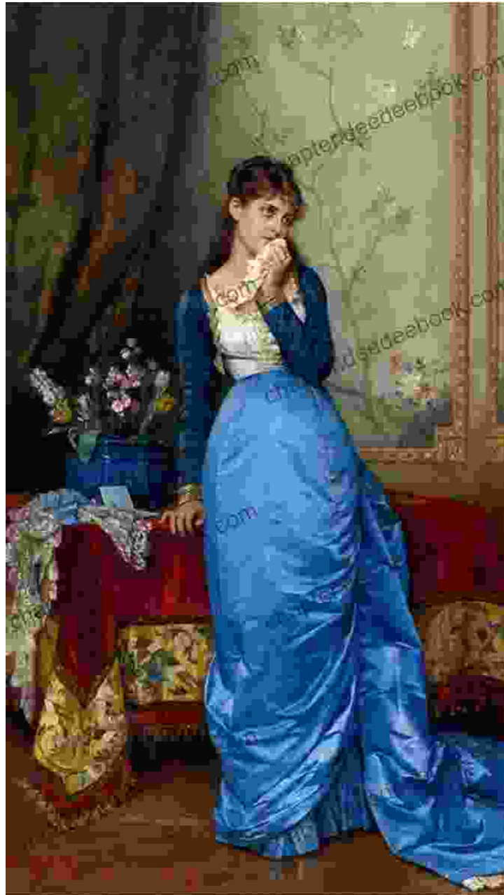
Auguste Toulmouche, The Letter, 1870