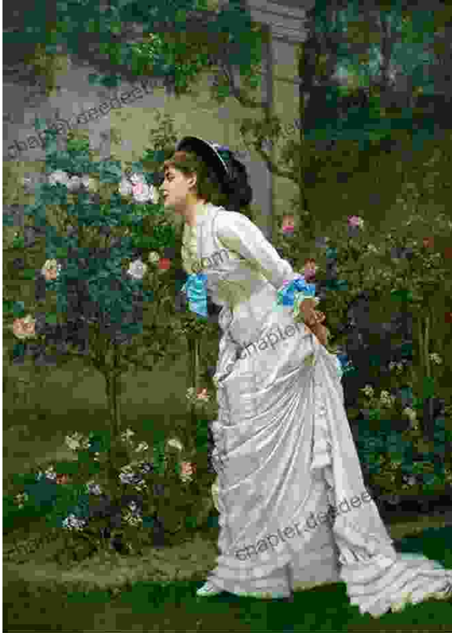
Auguste Toulmouche, The Rose, 1875

This exquisite painting depicts a young woman holding a single rose. Her eyes are closed, as if lost in the beauty and fragrance of the flower. The soft, ethereal colors and delicate brushstrokes convey the fragility and ephemeral nature of both the rose and the woman's youthful beauty.