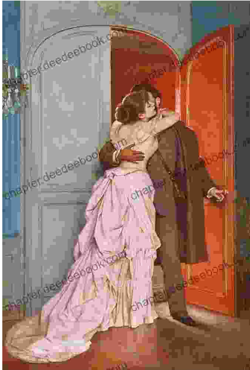
Auguste Toulmouche, The Kiss, 1857

This enchanting painting depicts a tender moment between two lovers. The woman, clad in a flowing white dress, leans in for a kiss, her eyes closed in blissful anticipation. The man, with his piercing gaze and warm smile,