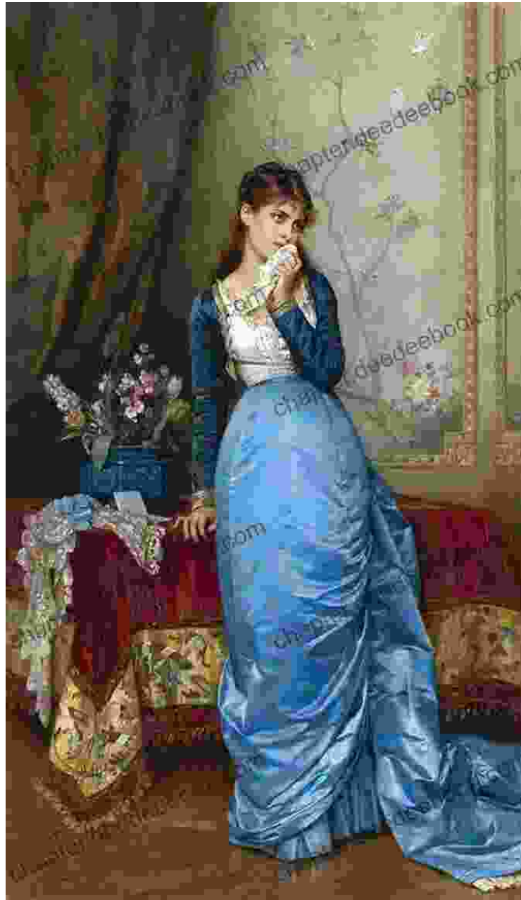
Auguste Toulmouche, Self-Portrait, 1879