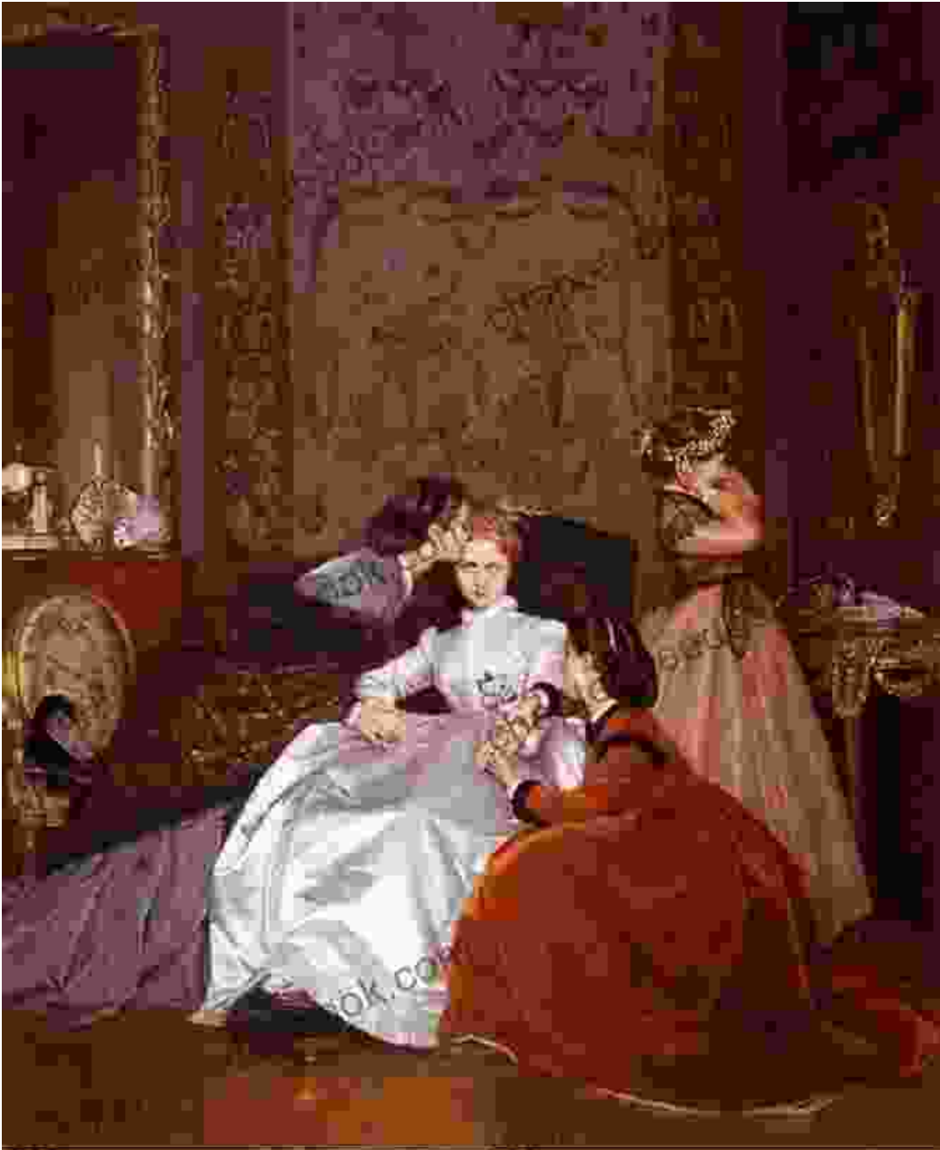
Auguste Toulmouche, The Proposal, 1876

This heartwarming painting depicts a moment of great anticipation. A young man kneels before a woman, his eyes filled with love and hope. The woman, with her gentle smile and modest expression, holds her hands